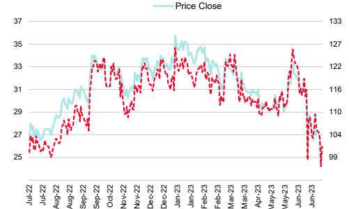
TOA Paint (TOA TB)